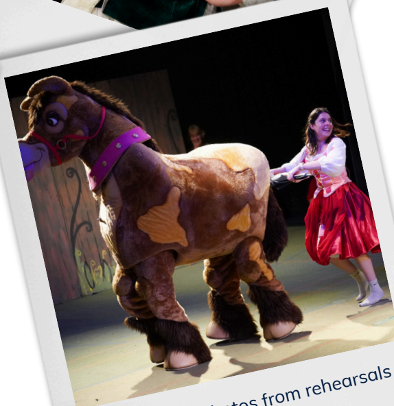
A few candid photos from rehearsals